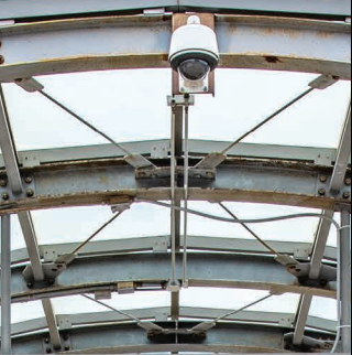
Heritage Court Entrance